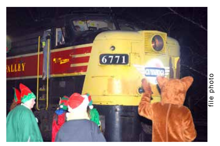
Elves and a bear greet the CVSR's Polar Express at the North Pole (actually Peninsula Ohio, but don't tell the kids).

Read the Flatwheel online at www.div4.org